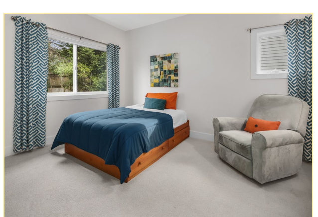
BEDROOMS TO DREAM ABOUT