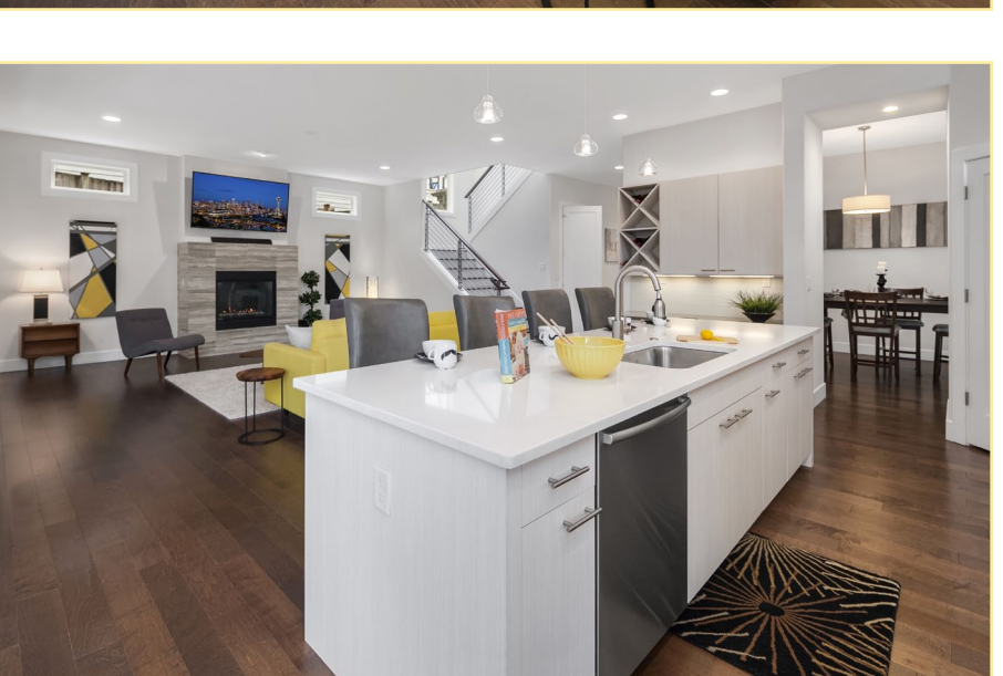
KITCHEN-FAMILY GREAT ROOM